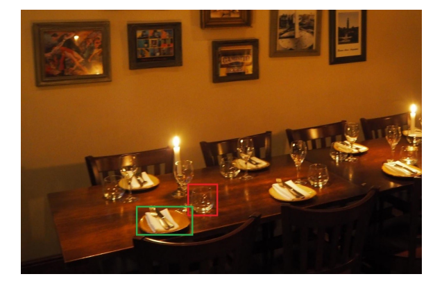
Figure 1: LOCATEDNEAR facts assist the detection of vague objects: if a set of knife, fork and plate is on the table, one may believe there is a glass beside based on the commonsense, even though these objects are hardly visible due to low light.

1. LOCATEDNEAR facts provide helpful prior knowledge to object detection tasks in com-