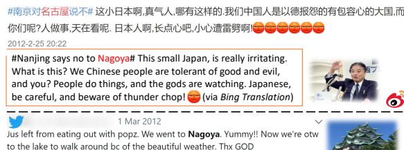
Figure 1: Two social media messages about Nagoya from different cultures in 2012